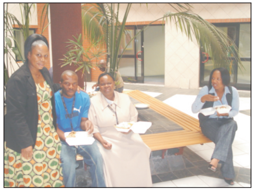
"We are one". Institutional Unity is forged in this way