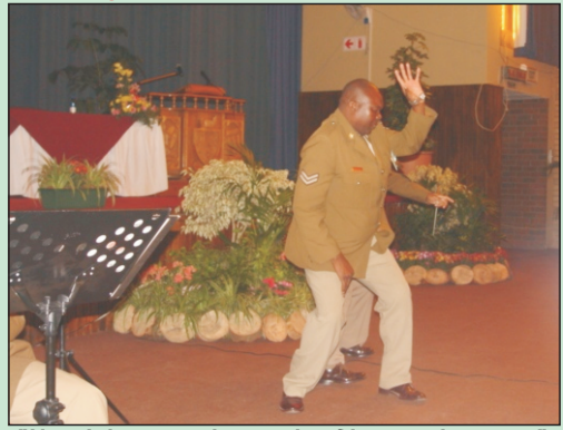
"Now I dance to the music of love and not war", the Military Brass Band provided music, the food of love.

formulated policies that are aimed at improving service delivery. The question that keeps coming is the extend to which policies that are approved are implemented to produce tangible results. It is the responsibility of all members of the public service to translate the policy objectives of government into service delivery programmes"