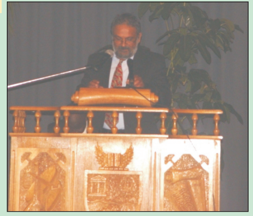
Honorable MEC Saád Cachalia delivering a key note address during the Africa Public Service Day at the Univeristy of Limpopo