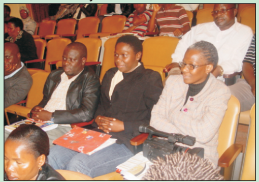
Treasury employees at the Africa Public Service Day

"A committed public servant is a catalyst to a result orientated implementation of public service delivery" he concluded.